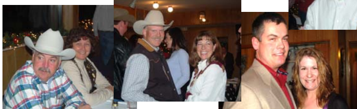
Awards Banquet Candids