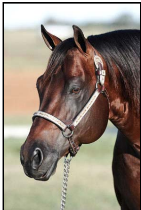
WEST COAST WHIZ