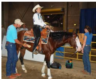
“On Deck” at the Summer Slide

Now in its third year, The International Reining Festival is proud to announce the inaugural “Loot For Grassroots” Non Pro awards program to be held in conjunction with The International Reining Festival, October 14-19, 2008 in Denver, Colorado.