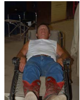
Takin' a break during the RMRHA Summer Slide

“Neither a no score nor a 0 is eligible to place in a go round or class, but a 0 may advance in a multi-go event while a no score may not. In the event not enough horses qualify for total purse distribution, the undistributed portion of the purse will be retained by show management.”