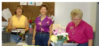
The show office at the Summer Slide runs smoothly thanks to these ladies.

Must have earned no more than $24,999 LTE as of 1/1/2008 in order to be eligible for the Loot. See the International Reining Festival website for details. InternationalReiningFestival.com